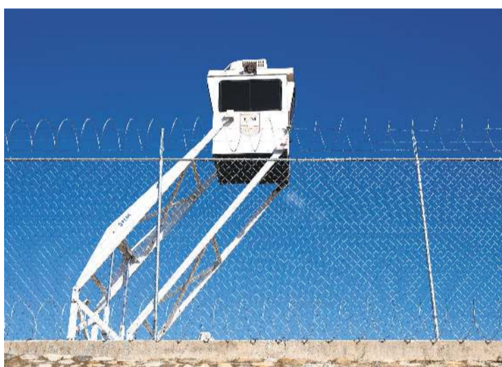
Mexican officials recently installed a chain-link fence along the Tijuana River channel to discourage migrant crossings.

Just south of the border wall in San Ysidro, Mexican officials have installed a chain-link fence reinforced with razor wire at the top and bottom that prevents entry to a section of the Tijuana River