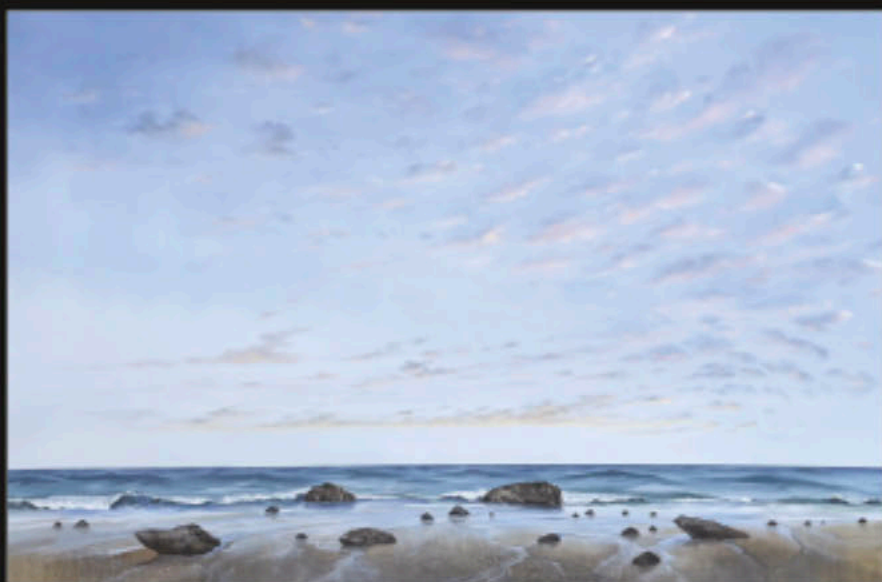
Black Rock Beach, 72 by 48 inches