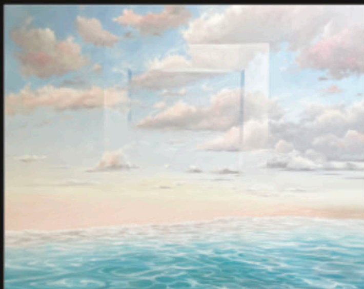
Water's Edge, 60 by 48 inches