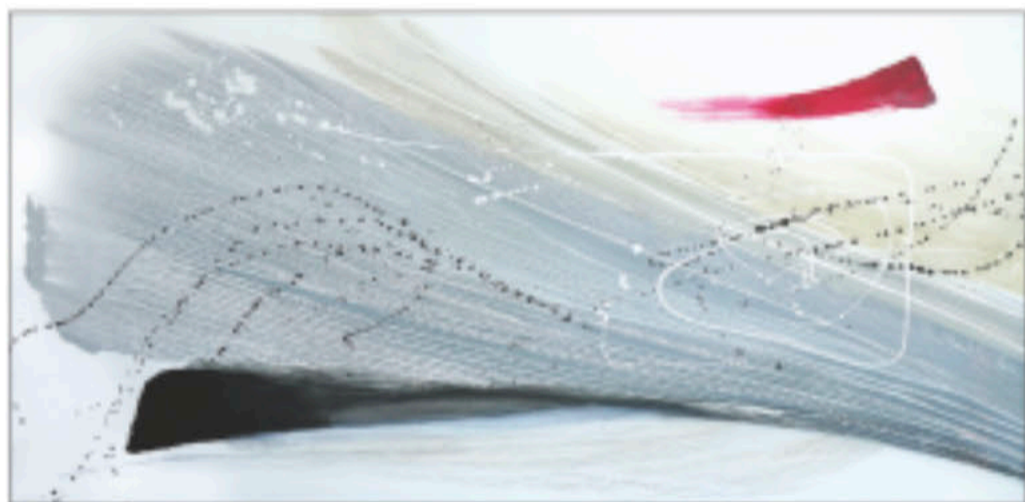
"Ambrosious" by Lisa Cuscuna measures 72 by 36 inches.

Inspiration comes from many parts of the artist's life, including respect for Buddhist teachings which she studied at an early age. "The body is a vessel through which creative en-