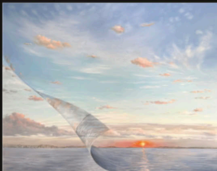
Passages II, 60 by 48 inches